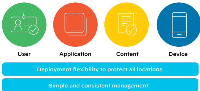
Figure 1: Core elements of network security

Our Next-Generation Firewalls inspect all traffic, including all applications, threats, and content, and tie that traffic to the user, regardless of location or device type. The user, application, and content—the elements that run your business—become integral components of your enterprise security policy. As a result, you can align security with your business policies as well as write rules that are easy to understand and maintain.